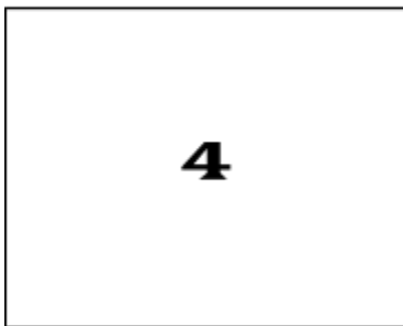
☐ Recess #1 Schedule Rotation