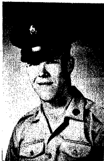
Ronald Wallace Memorial Scholarship

This scholarship is intended to honor his memory and to help others.